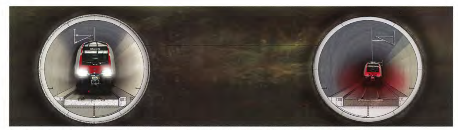
Two single bore tunnels will give the new double track line Oslo-Ski both a significant degree of flexibility and modern level of rail safety.