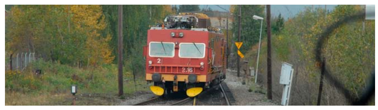
Train for renewal and installation.

istrative agencies. Government or local authority agencies are included under the term "administrative agencies". The Act also applies to every legal entity that is not an administration agency and which is a supplier of goods or services to an administration agency in conjunction with a security-graded procurement procedure. The National Rail Administration coordinates emergency preparedness work for infrastructure, traffic control and railway traffic. Technological choices must fall within the stipulations of the Act relating to Protective Security Services.