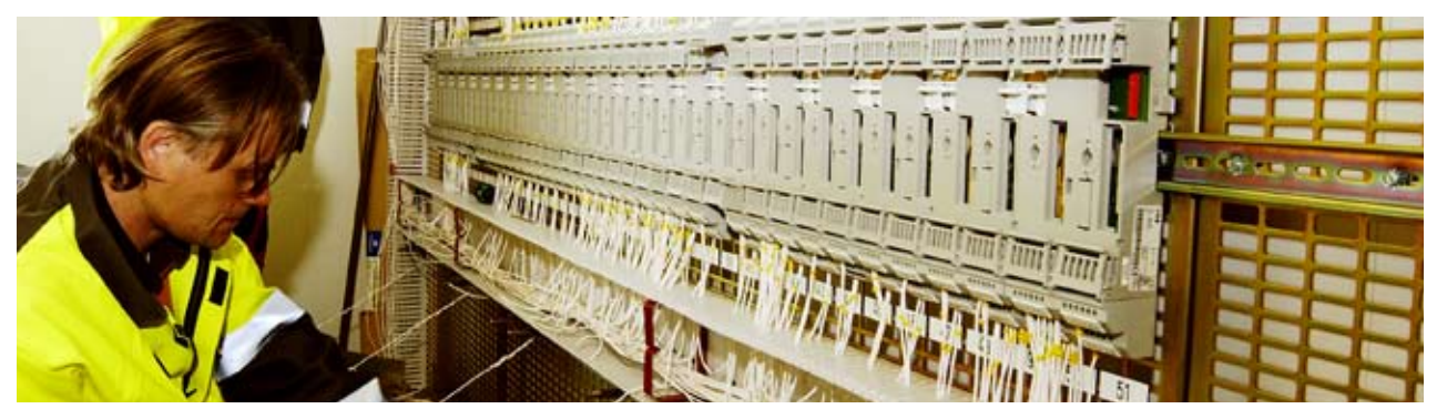
Part of safety installation.

Administration and other railways which traditionally have a renewal cycle of 30 to 40 years or more for the "heaviest duty" facilities.