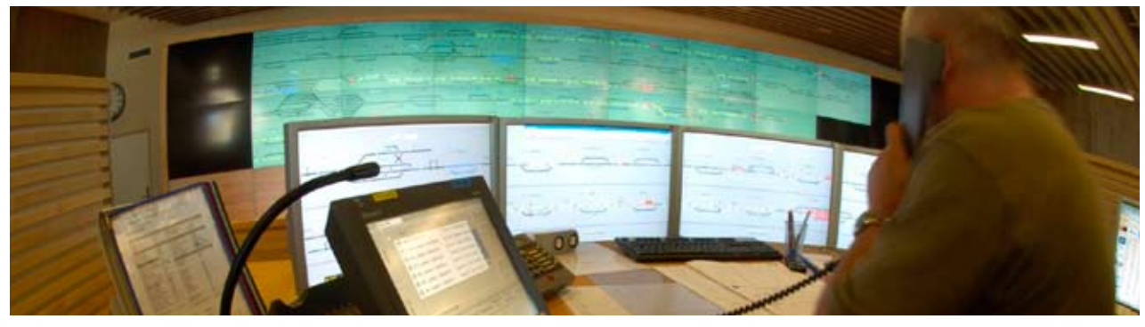
Centralized traffic control.

Process standard EN-50126 shall be used in the procurement of components and in the project design of new facilities. This requires requirements to be drawn up for reliability, maintainability and safety for components and facilities, adapted to the requirements of the route concerned. It is expected that infrastructure uptime will be increased further through this work.