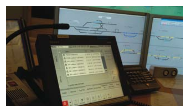
GSM-R terminal.

logical solutions that can contribute to increased competitive strength. Even without any ambitions to be at the forefront of technology internationally, considerable R&D investment would be required to produce the desired results with a market-oriented strategy.