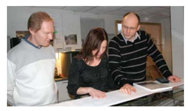
Discussion of technical solution.