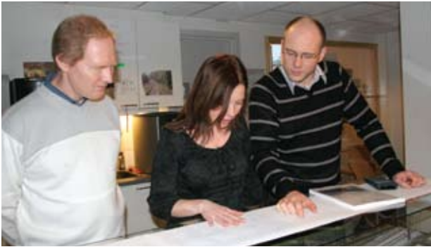
Discussion of technical solution.