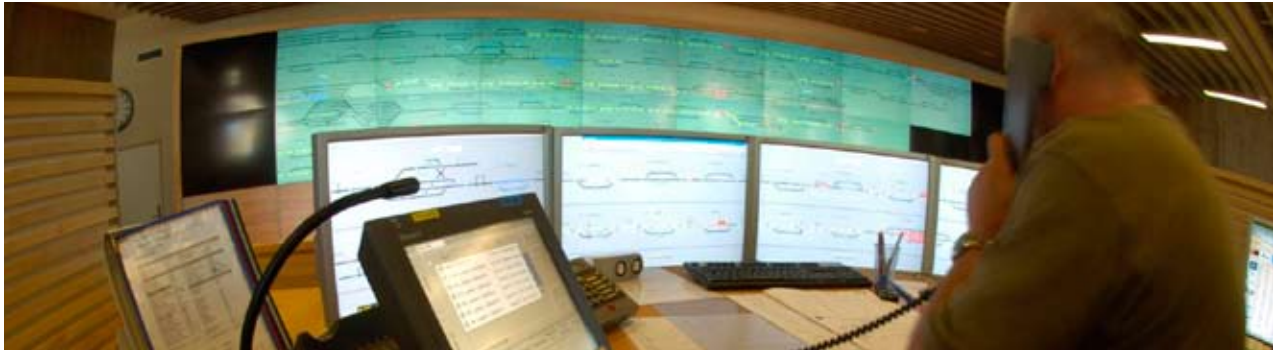
Centralized traffic control.

Process standard EN-50126 shall be used in the procurement of components and in the project design of new facilities. This requires requirements to be drawn up for reliability, maintainability and safety for components and facilities, adapted to the requirements of the route concerned. It is expected that infrastructure uptime will be increased further through this work.