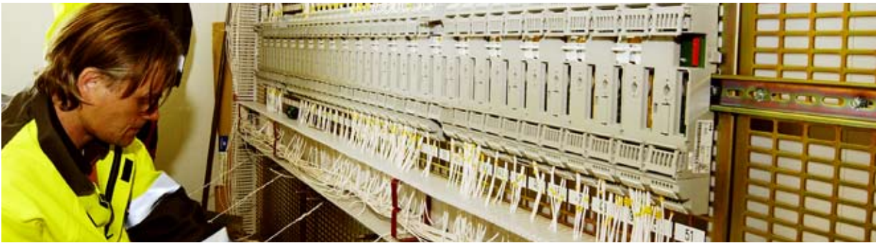
Part of safety installation.

Administration and other railways which traditionally have a renewal cycle of 30 to 40 years or more for the “heaviest duty” facilities.