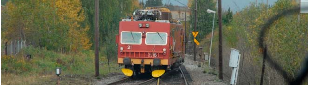
Train for renewal and installation.

istrative agencies. Government or local authority agencies are included under the term "administrative agencies". The Act also applies to every legal entity that is not an administration agency and which is a supplier of goods or services to an administration agency in conjunction with a security-graded procurement procedure. The National Rail Administration coordinates emergency preparedness work for infrastructure, traffic control and railway traffic. Technological choices must fall within the stipulations of the Act relating to Protective Security Services.