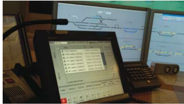
GSM-R terminal.

logical solutions that can contribute to increased competitive strength. Even without any ambitions to be at the forefront of technology internationally, considerable R&D investment would be required to produce the desired results with a market-oriented strategy.