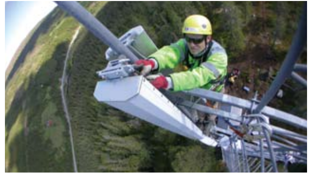
Assembly of GSM-R.