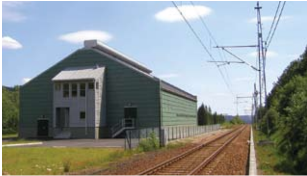
Leivoll substation for frequency conversion.